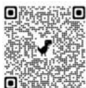
Girton Village Community FB