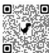
Girton PC Twitter @GirtonPCouncil

The mobile post office is open on Friday 1.30-2.30 pm in the car park in Orchard Close behind the old Scallywags Nursery.