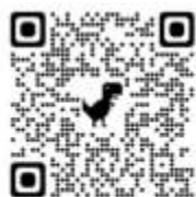
Girton Parish Council Website

You may also use the QR codes below to contact us: