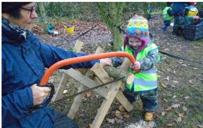
Cottontails Sawing at Forest School

We've had such a fun term at Forest School, in recent weeks the children have all been sawing their own wood to make Christmas decorations. We talked about safety when using the saw and they all did a brilliant job and were so proud of what they made. There have been many fungi around the woodland area recently. The children were really interested in looking at them and identifying what they were. We found some really interesting and unusual types including one that looked like jelly! For our last Forest School session before the end of term, we will be having a camp fire to toast something delicious that we haven't quite decided on yet, I wonder what we'll choose!