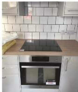
Work in progress at Dovehouse Court.