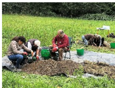
Anglo-Saxon bread oven? Open excavation next to IVC staff car park