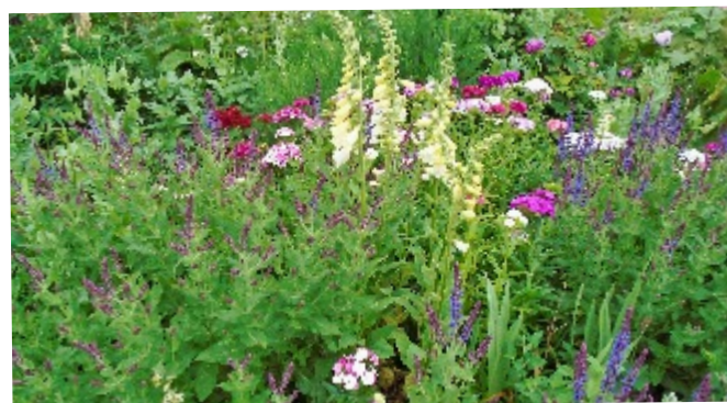
[RHS garden, Hyde Hall, June 2019]

A recent telephone call from a friend in Sweden reminded me that my garden is there for my enjoyment as well as hard work – and that is what I hope to do, appreciating how lucky we have been to have gardens and space during these months of lockdown.