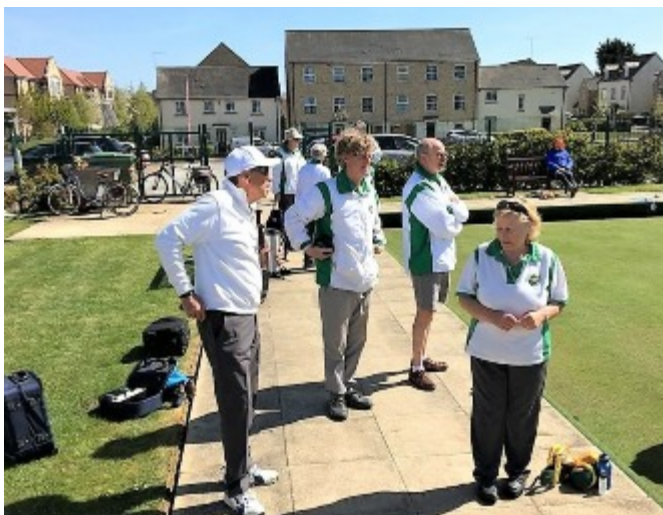
Sunny start to our friendly against Newnham