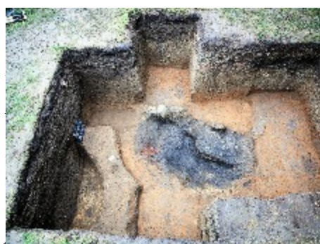
Test pit excavation at Histon Manor