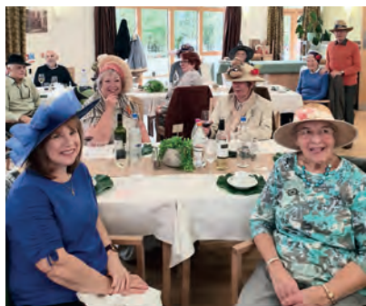
The restaurant at Abbeyfield

you cry as though it's never been done before. Just take a moment to think about what you will miss by not coming along to such a function – you will miss all our gossip – believe me there is plenty of that all stored up and ready for release. You will miss free coffee and a cake or savoury snack and of course your vocal chords need some gentle exercise after the long lockdowns we have been experiencing over the last couple of years.