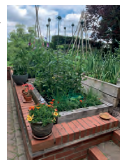
Coming to fruition

Sowing seeds and nurturing plants is a way of investing in the future, which is one of the reasons I, personally, find it so rewarding. On a lovely sunny day get out in the garden, do some weeding, give shrubs and roses an organic feed, prune winter flowering shrubs, put in support for tall growing herbaceous perennials, mow the grass and maybe decide to leave an area of long grass to invite in more beneficial insects, so necessary for pollination of food crops. If you don't have a garden it is amazing what you can grow on a balcony or in a few planters on windowsills. Many salad crops, tomatoes and peppers will happily grow in a sunny spot. When you have finished sit back and admire what you have done and look forward to the rewards later. Happy gardening!