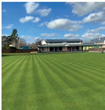
The Bowls Green

scarifying and top dressing. This is followed by the start of the cutting programme which begins with a cut of approximately 10 mm gradually reducing down to 8 mm. I don't think the majority of us quite realise the amount of work that goes into the maintenance and preparation of the Green, all done on a purely voluntary basis under the supervision of our valued Professional. Our thanks go to our great team of volunteers.