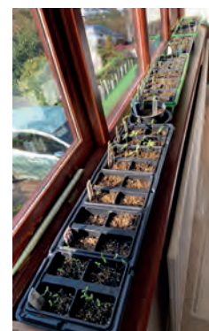
Windowsill of hope

April is the month when we really see plants rushing into growth, the early spring flowers and shrubs such as hellebores, crocus, daffodils, pulmonaria, mahonias and winter flowering honeysuckles and clematis have done the job of providing nectar for early foraging bumble bees and insects. Now is the time to start sowing seeds outside. You can warm up the soil by putting a cloche over it for a few days first. Beetroot, carrots, lettuce, peas, hardy flowers such as sweet peas, calendulas, rudbeckias and even a patch of annual wildflower meadow to attract a variety of insects can all be safely sown after the last frosts. Always have some fleece handy though, just in case, especially for the blossom on young fruit trees.