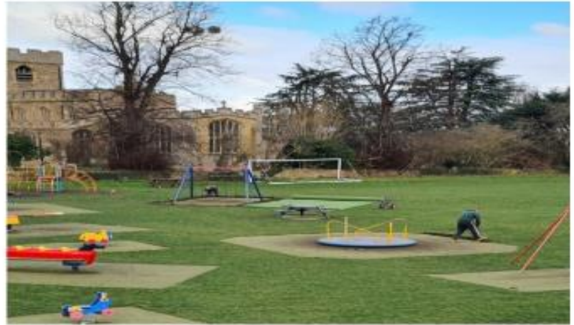
New surfaces for the play equipment go down at the recreation ground.

Get in touch...of course we are only an email or phone call away too 😊