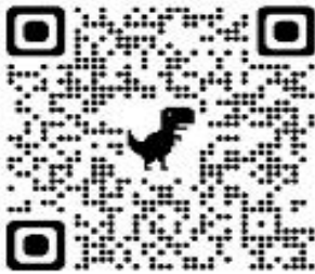
Girton Parish Council Website QR

You will always find articles and reports to keep you up to date in the Girton Parish Newsletter too.