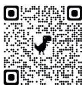
Girton PC Twitter @GirtonPCouncil