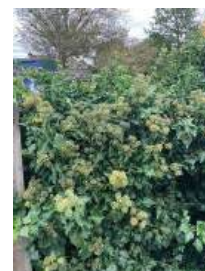
Holly and ivy

Ivy ( Hedera ) in variegated forms is popular and widely used in planters and hanging baskets or for covering unsightly walls. Though native ivy is widely disliked because of its clinging and climbing habits and is hard to control, it is a valuable plant for wildlife: wrens nest in its lower reaches, lovely small holly blue butterflies emerge from ivy hedges in early spring, and its “bobbles” of green flowers support one species of wasp and develop into dull blue berries loved by pigeons and blackbirds.