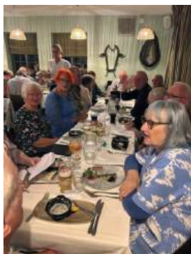
Prize Giving Dinner at The Plough in Coton

May I take this opportunity to wish all our readers a very Merry Christmas and a very healthy, happy and peaceful New Year.