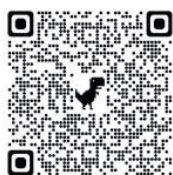
Girton Village Community FB