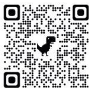
Girton Parish Council Website

You can also use these QR codes to contact us: