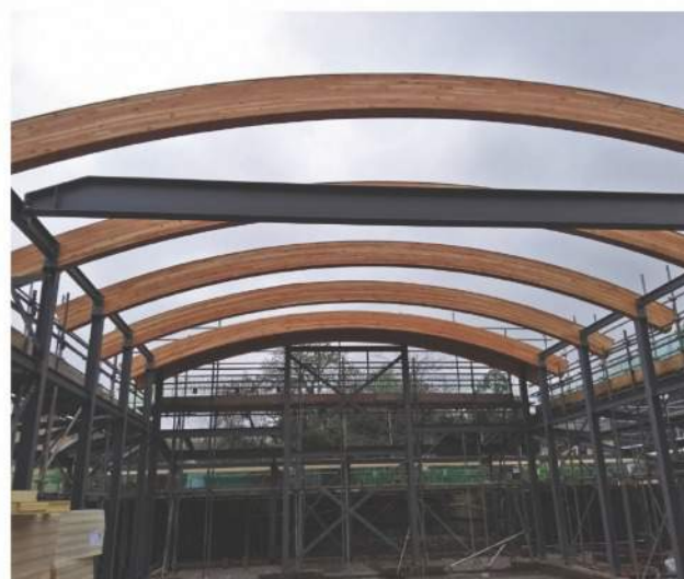
Glulam beams in place on the William Collyn Community Building.