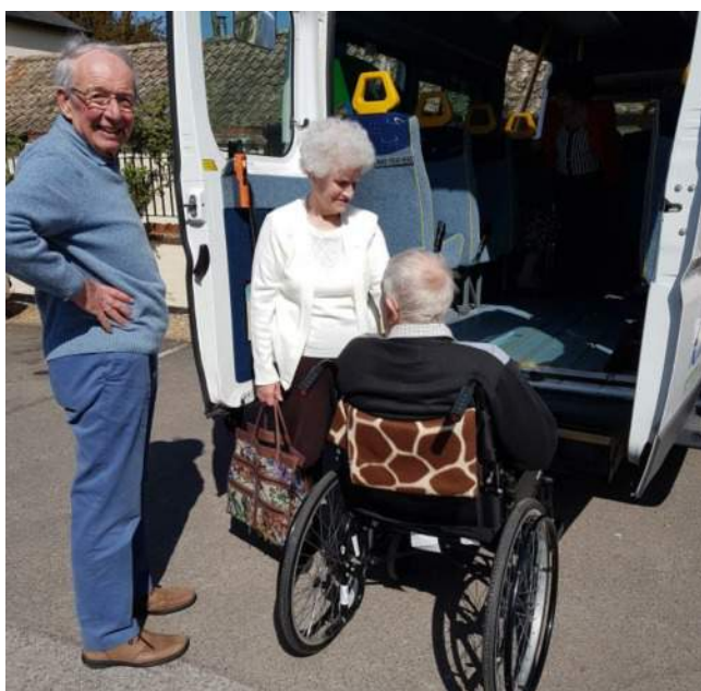
Both photos show happy faces for the trip home.